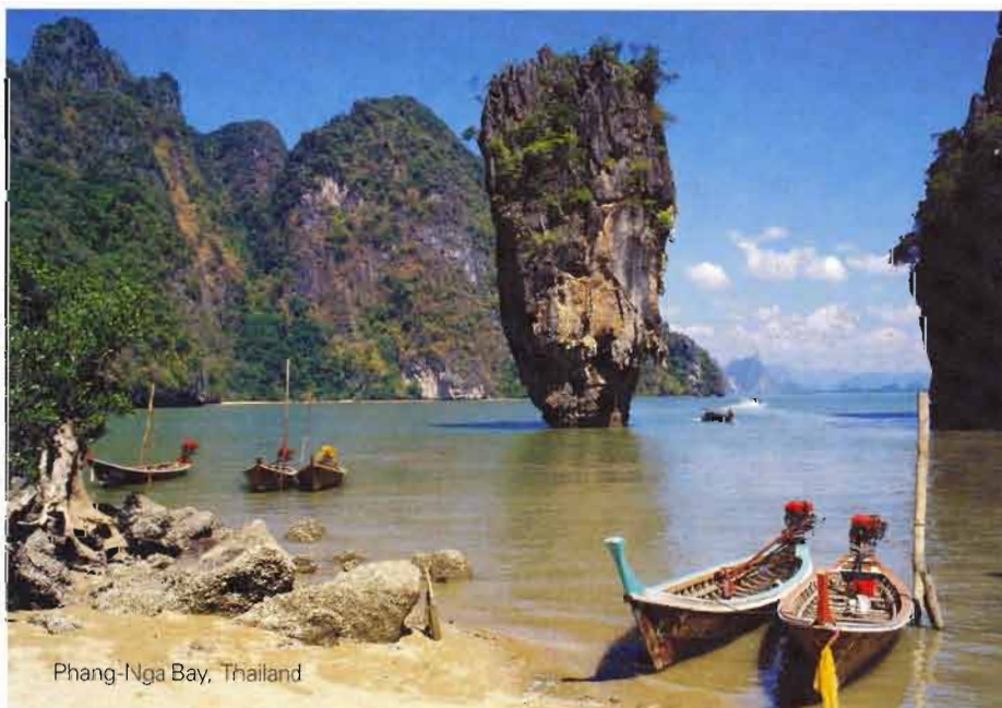
Phang-Nga Bay, Thailand

Where to stay: The Sarojin, which nests on 10 acres between a lagoon and the Andaman Sea in Khao Lak, is less than an hour from Phuket Airport, the Similan and Surin islands, Phang-Nga Bay and three golf courses. Each of its 56 accommodations has a king-sized bed and a bathtub for two; many also feature a private plunge/relaxation pool. The resort employs "imagineers" to fulfill your requests—from a private cruise on the Sarojin's luxury boat to an elephant trek to a Champagne jungle safari. Couples can indulge in the two-hour Adventure Revival massage at the spa, sunbathe anywhere along the seven miles of beach or recline within a curtained pavilion that appears to float above the infinity edge pool. Rooms start at $429 per night. (sarojin.com)